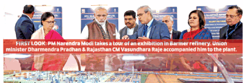
FIRST LOOK: PM Narendra Modi takes a tour of an exhibition in Barmer refinery. Union minister Dharmendra Pradhan & Rajasthan CM Vasundhara Raje accompanied him to the plant.

Barmer: Prime Minister Narendra Modi and Rajasthan CM Vasundhara Raje sounded the poll bugle in Rajasthan, almost a year ahead of the assembly polls and a fortnight before crucial bypolls to LS, by accusing the Congress of "misleading people" by only holding stone laying ceremonies and ignoring implementation.