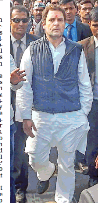
A LONG WAY TO GO Rahul Gandhi during a road show in Amethi on Tuesday

Congress in UP, meanwhile, only springs to life to give a rousing welcome to its Amethi MP as it has done over the last 2 days.